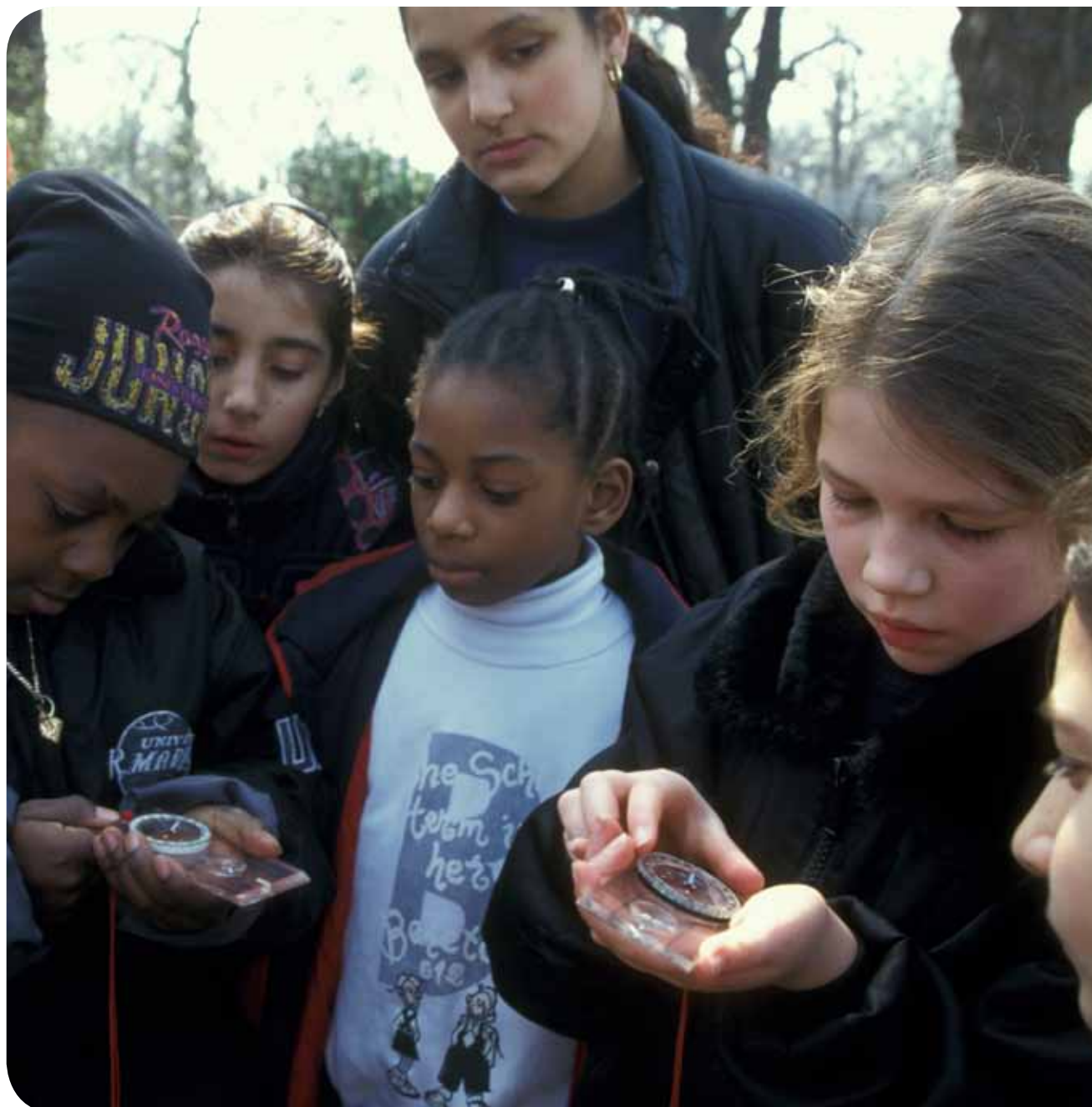
Children and young people